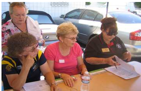
Volunteers at the Oxnard Health Fair 09/26/10