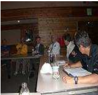
Zones 5 and 6 meeting September at Carpinteria Lions Clubhouse

All interested Lions, please contact PCC George Stewart at gstewart4a3@charter.net . The CMC will make a decision by November 1, 2010.