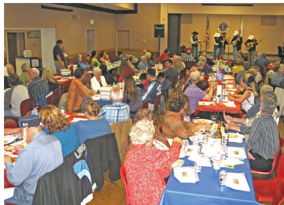
Full House at Morro Bay Vet's Hall & Oly Mountain Boys in the Background

On Sunday, February 16 th Morro Bay Lions Club sponsored a fundraiser for the Morro Bay High School Music Boosters. The event held in the MB Vet's Hall and titled Tunes & Noodles featured the Oly Mountain Boys bluegrass band and a spaghetti dinner. The Oly Mountain Boys combined bluegrass picking and tight three-part harmony while performing a strong core of Bill Monroe and Stanley Brothers material some with a traditional bent and others drawing liberally from folk-rock and Americana. MB High School students performed between sets. Lions Club members prepared and served the food to over 200 attendees who complimented the food and stayed until the band stopped playing. Overall the project was a real success and enabled the Lions Club to help the MBHS Music Boosters support the music program in the local high school with a check for $2000.